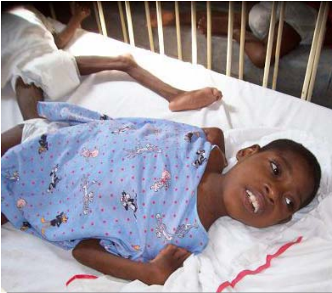
A few of our special children in the Mercy & Sharing Abandoned Infant Unit of the Government Hospital in Port-au-Prince

On May 17 th 2007 the Haitian Government created a new branch of the Ministry of Social Affairs - the Department for Integration for Handicapped Persons . This is a huge step that will bring to light the dire situation of handicapped children in Haiti.