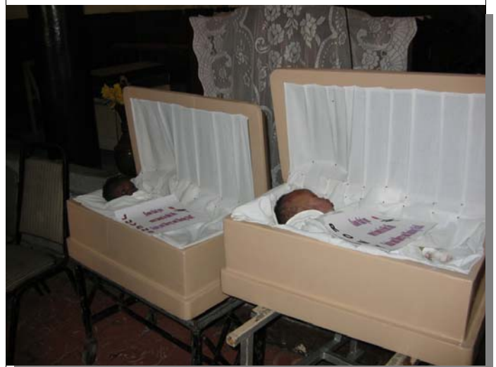
In this world, they were loved...