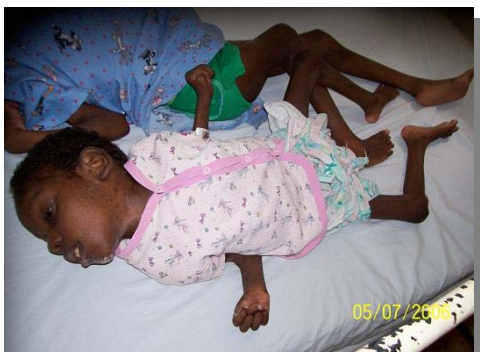
We have many severely disabled children like these at our Abandoned Infant Unit