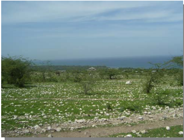
A view from the top of the Williamson property looking toward the ocean.

Important issues such as the overall site plan for the positioning of all the buildings, drainage & elevation issues, power needs, plumbing needs and soil analysis have all proved to be very time-consuming and tech-